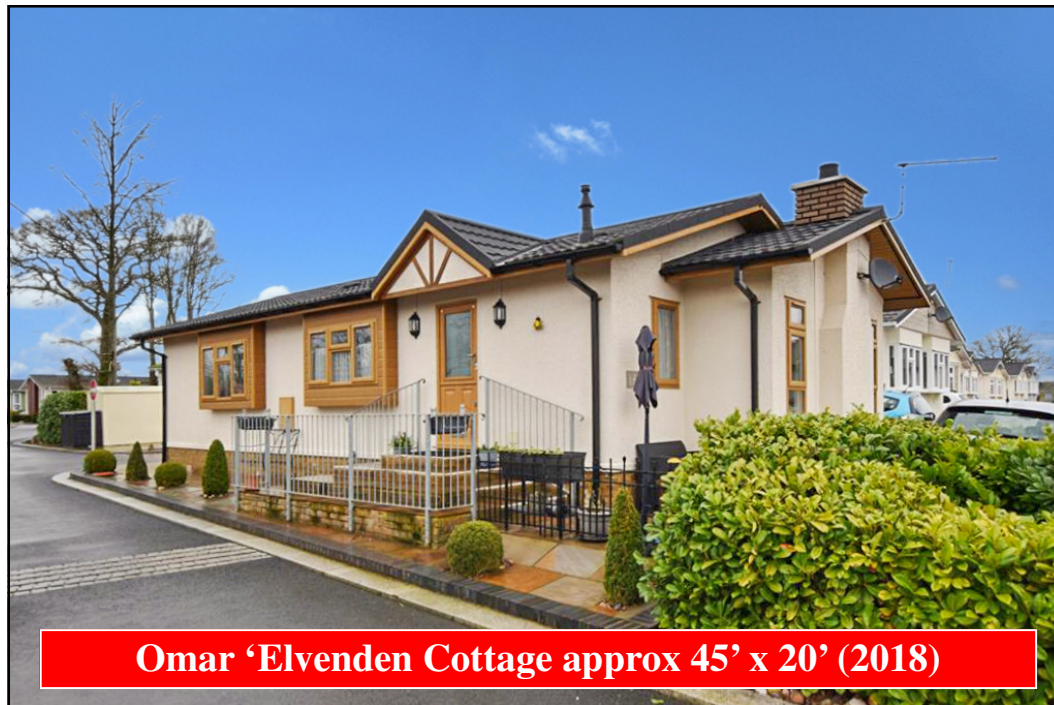
Omar 'Elvenden Cottage approx 45' x 20' (2018)

16 Jasmine Court, Organford Manor Country Park, Organford, Poole. BH16 6FJ